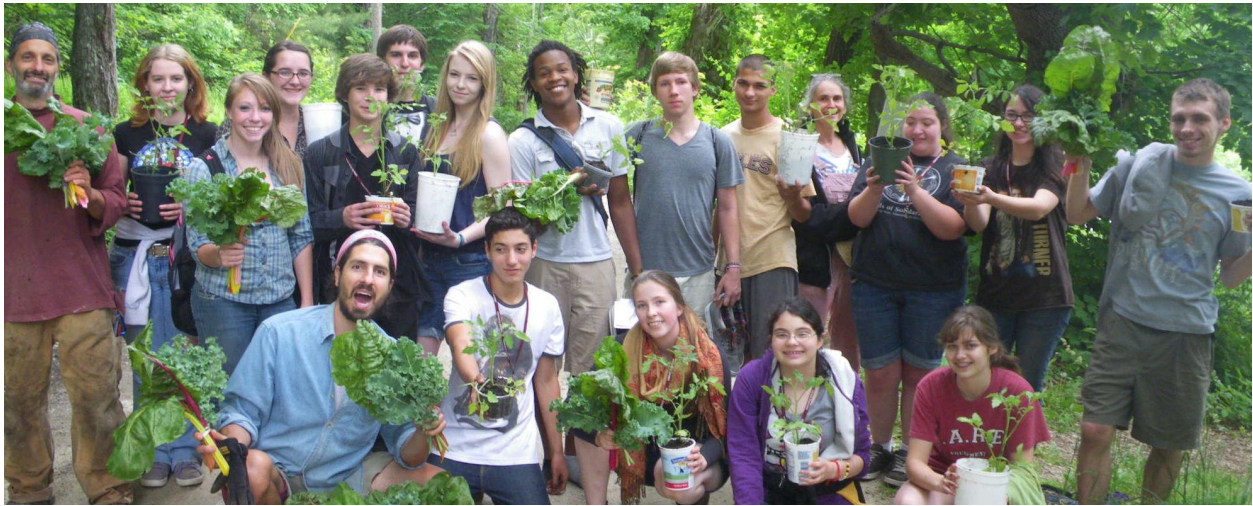
2013 SOL Garden Crew

SOL (Seeds of Leadership) Garden inspires service and activism among teens as they use their hearts, minds, and bodies to cultivate food and a hopeful future. Since the program's inception in 1998, over 300 SOL Garden participants, most low-income and underemployed, have grown and donated thousands of pounds of vegetables, constructed their own solar greenhouse, and helped plant gardens across the community.